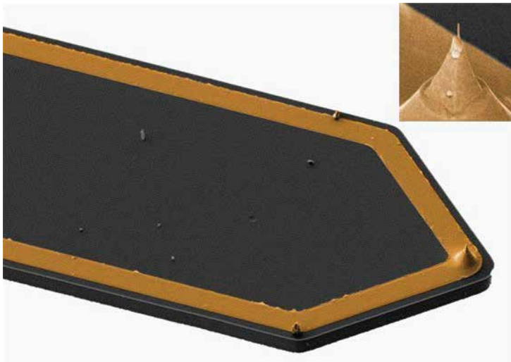
Conductive, self-sensing cantilever with a solid platinum tip featuring a tip radius <20nm

For such measurements the AFSEM™ works with conductive, self-sensing cantilevers with sharp, solid platinum tips. The platinum tips are grown by focused electron beam induced deposition. A gold lead connects the tip to a current amplifier.